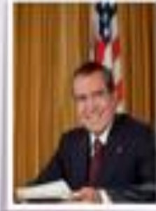
Richard M. Nixon (37th)