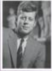
John F. Kennedy (35th)