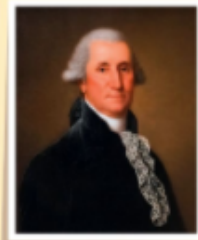
George Washington (1st)