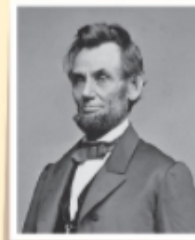
Abraham Lincoln (16th)