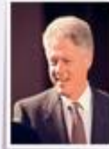
Bill Clinton (42nd)