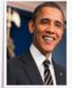
Barack Obama (44th)