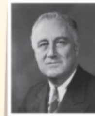
Franklin D. Roosevelt (32nd)